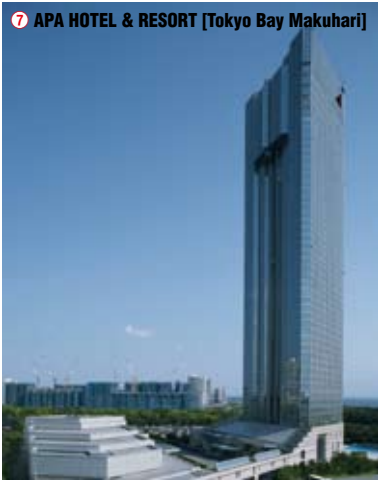
7 APA HOTEL & RESORT [Tokyo Bay Makuhari]