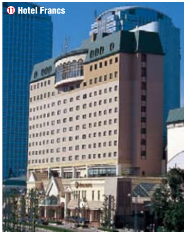
11 Hotel Francs