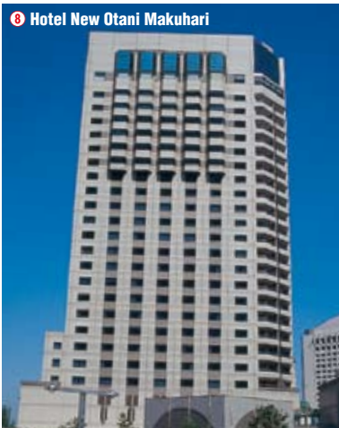
8 Hotel New Otani Makuhari