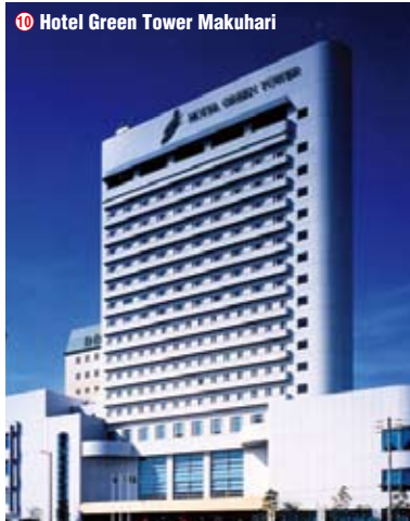
10 Hotel Green Tower Makuhari