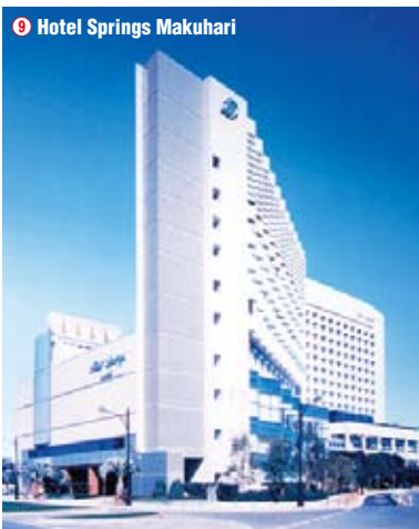
9 Hotel Springs Makuhari